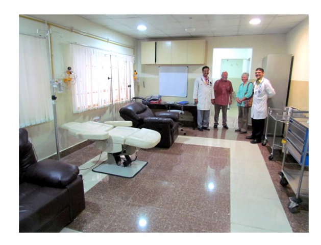
New Outpatient Chemotherapy Room