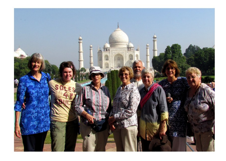
tour <u>click here</u> if you are reading the electronic edition of this newsletter. Otherwise, you may view it by going to <a href="http://youtu.be/I7RzVQ2Vdus">http://youtu.be/I7RzVQ2Vdus</a> on the internet.

To enjoy a ten minute video showing highlights of the study