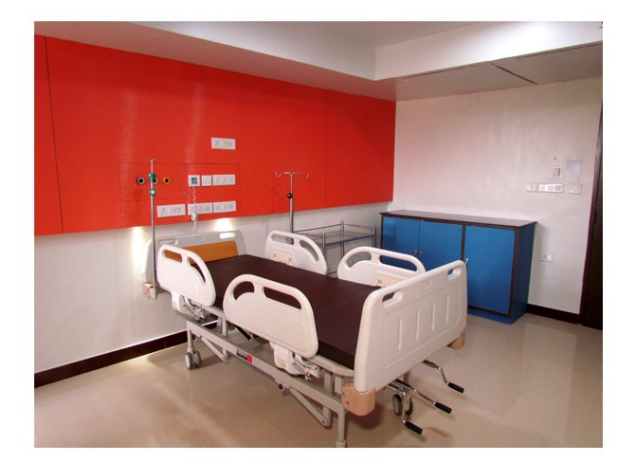
New Child Friendly Bone Marrow Transplant Room

During the Governing Body Meeting in September two new hospital units were dedicated. The long-awaited new Bone Marrow Transplant Unit was one of them. The new unit includes five patient rooms, two of which are brightly colored to be used when needed for children. It is a state of the art unit which is a great addition for treating patients. The other unit which was dedicated is the new Day Care Unit for administering chemotherapy to outpatients. It is a great improvement to the previous cramped and dismal room where patients used to receive their chemotherapy.