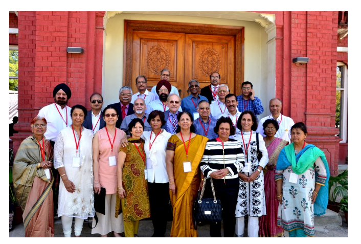
50th Year Reunion - Batch of 1967