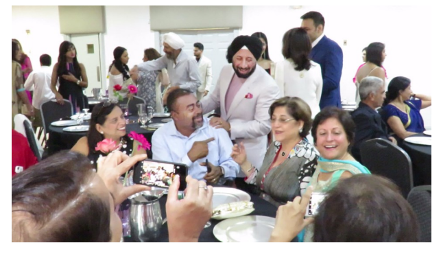
Friday's Fine Dinning and Fun at the Ethiopian Restaurant