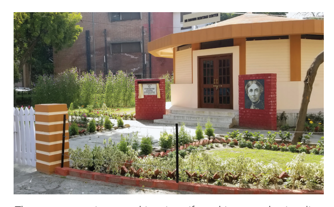
The center contains many historic artifacts, history and a time line of the hospital's development, all beautifully displayed.